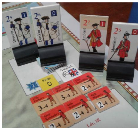
And forces the French to seek refuge behind stone walls.