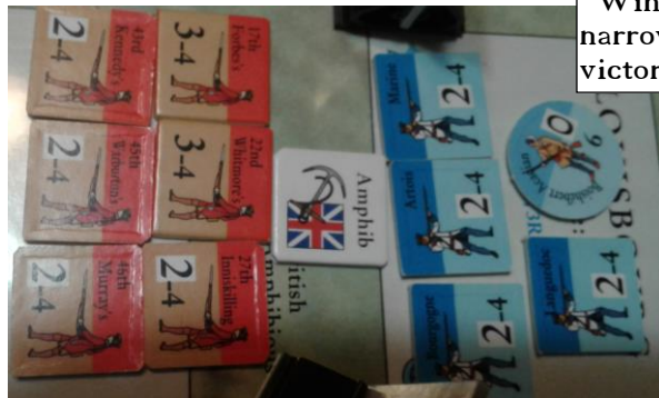
Wins a narrow victory.