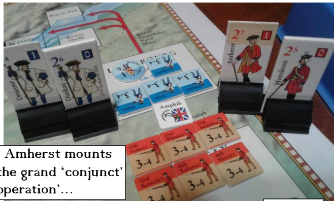
Amherst mounts the grand 'conjunct' operation'...